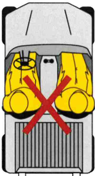
Non-straddled seat [bench/bucket style]