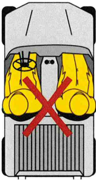
Non-straddled seat [bench/bucket style]